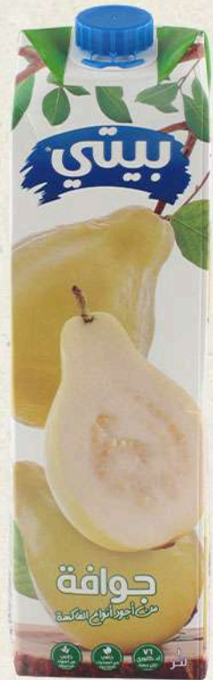
13245 BEYTI GUAVA JUICE 12 X 1L