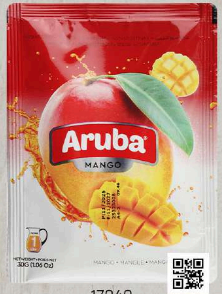
17040 ARUBA INSTANT DRINK MANGO 10 x 12 x 30g