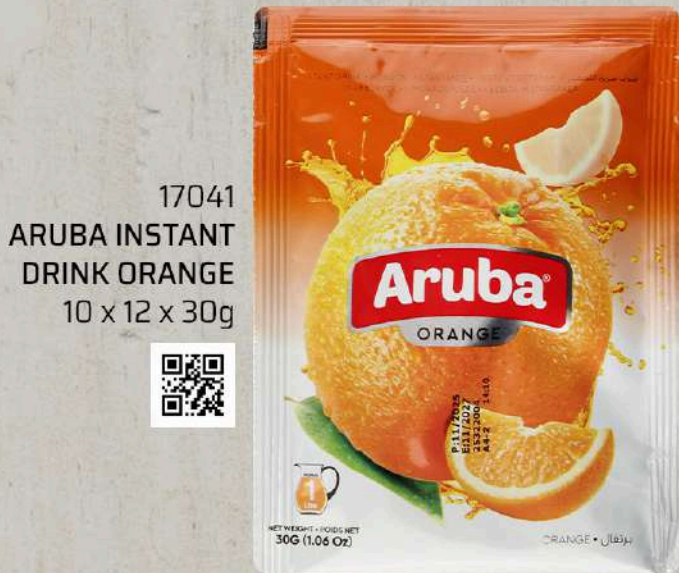
17041 ARUBA INSTANT DRINK ORANGE 10 x 12 x 30g