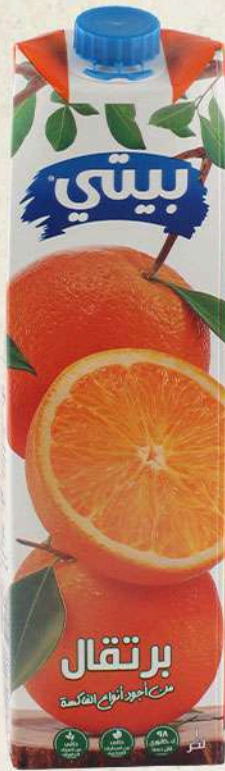
13242 BEYTI ORANGE JUICE 12 X 1L