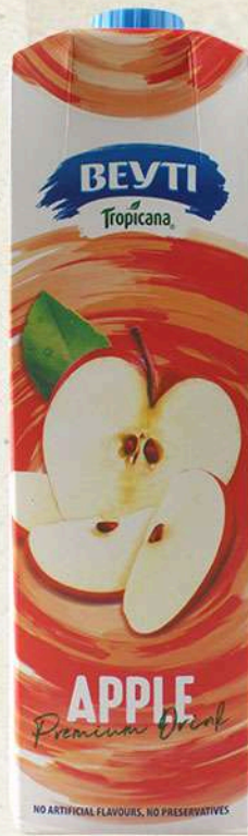
13243 BEYTI APPLE JUICE 12 X 1L