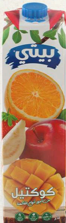
13246 BEYTI COCKTAIL JUICE 12 X 1L