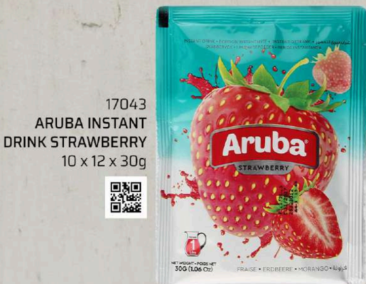
17043 ARUBA INSTANT DRINK STRAWBERRY 10 x 12 x 30g