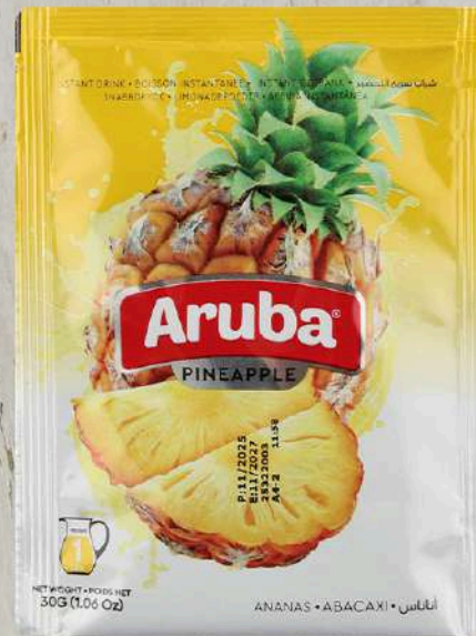
17042 ARUBA INSTANT DRINK PINEAPPLE 10 x 12 x 30g