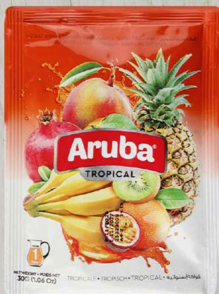
17044 ARUBA INSTANT DRINK TROPICAL 10 x 12 x 30g