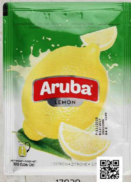
17039 ARUBA INSTANT DRINK LEMON 10 x 12 x 30g