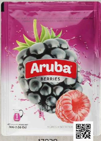
17038 ARUBA INSTANT DRINK BERRIES 10 x 12 x 30g