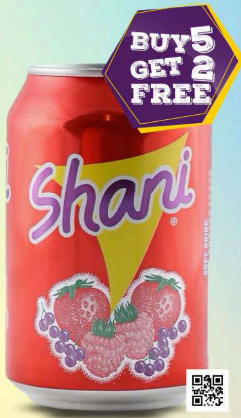
1173 SHANI CANS 24 X 330ML