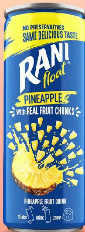
13010 RANI PINEAPPLE WITH PIECES 24 x 240ML