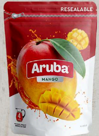
13835 ARUBA INSTANT DRINK MANGO 20x500G