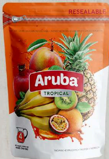
13839 ARUBA INSTANT DRINK TROPICAL 20x500G