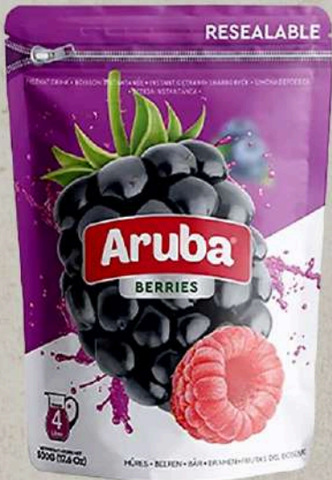
13833 ARUBA INSTANT DRINK BERRIES 20x500G