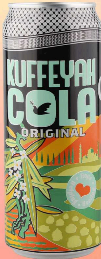
16548 COLA KUFFEYAH 24 X 330ML