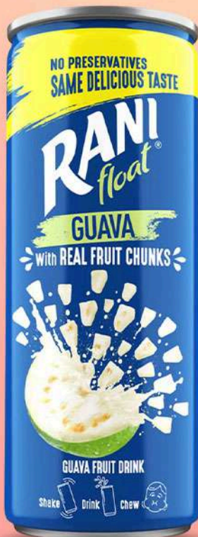
13009 RANI GUAVA WITH PIECES 24 x 240ML