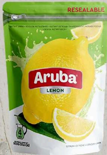
13834 ARUBA INSTANT DRINK LEMON 20x500G