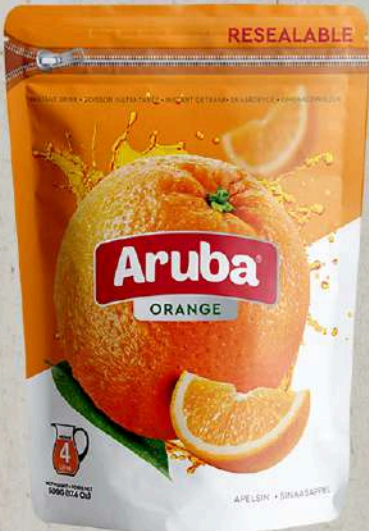
13836 ARUBA INSTANT DRINK ORANGE 20x500G