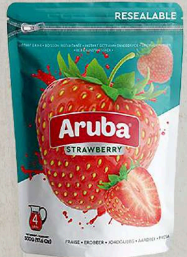
13838 ARUBA INSTANT DRINK STRAWBERRY 20x500G