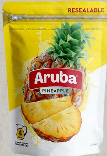
13837 ARUBA INSTANT DRINK PINEAPPLE 20x500G