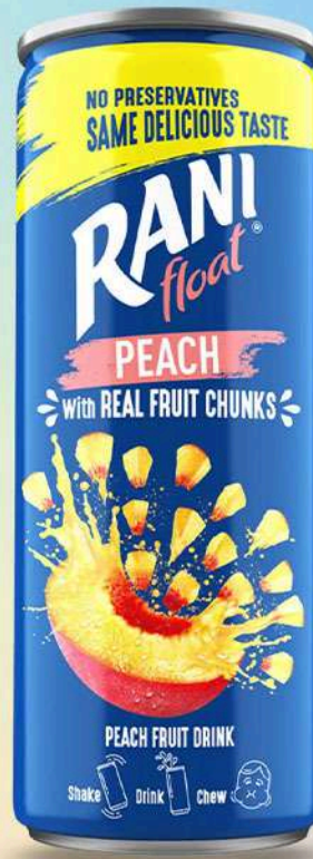
12868 RANI PEACH WITH PIECES 24 x 240ML