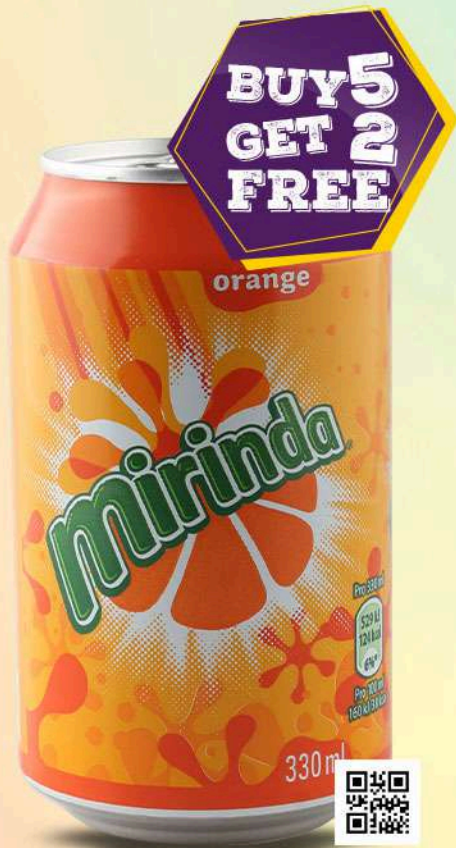
1171 MIRINDA ORANGE CANS 24 X 330ML