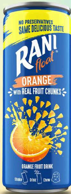
12867 RANI ORANGE WITH PIECES 24 x 240ML