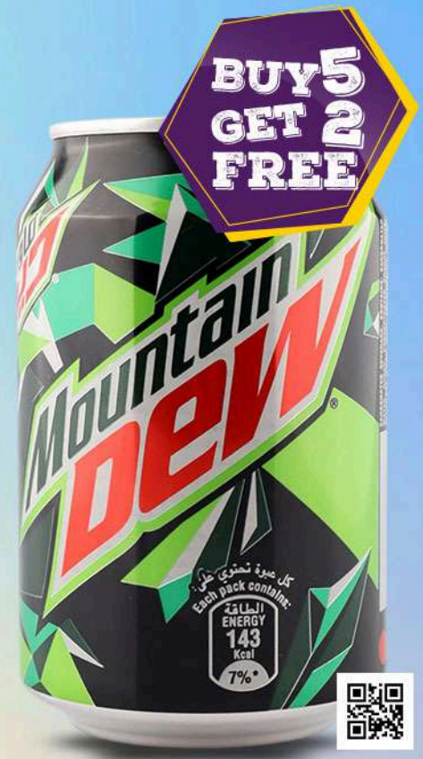
1172 MOUNTAIN DEW CANS 24 X 330ML